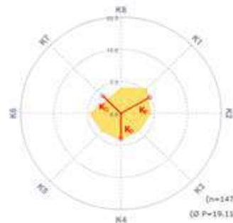
Average profile of learners in the Mechatronic Profession Main test COMET South Africa 2014