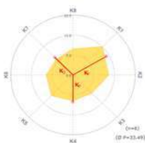
Average profile of teachers in the Mechatronic Profession Main test COMET South Africa 2014